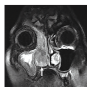
"Heterogeneously enhancing hyperintense nasal mass" Contrast MRI, coronal view By Jeremiah M. Esguerra, MD