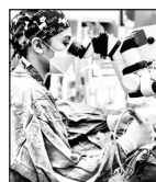
"Embrace your role and seize the day" iPhone 15 ProMax