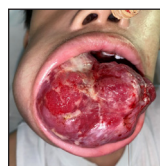
"Vascular tumor of the mandible" Oneplus 7 Pro