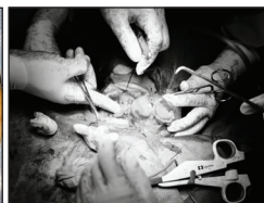
“Helping Hands” Fujifilm X-T5