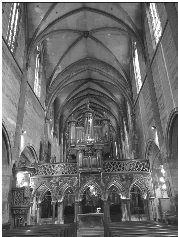
Figure. Rood screen in the 14th-century gothic Église Saint-Pierre-Le-Jeune, Strasbourg, France. Behind is the famous pipe organ of Johann Andreas Silbermann on which Helmut Walcha recorded a large part of his performances of Bach's organ works.

Today, there is much to be thankful for, and much more to remain open to. Our journal has maintained a respected position among its peers, and is ready to move forward. With this issue, we begin granting a Creative Commons Attribution NonCommercial-NoDerivatives 4.0 International ( CC BY-NC-ND 4.0 ) license 5 to articles published in the Philippine Journal of Otolaryngology Head and Neck Surgery, in addition to the copyright already transferred to the Philippine Society of Otolaryngology Head and Neck Surgery.