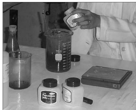
Figure 2. Preparation of kalachuchi ( Plumeria acuminata Ait.) ointment

available through corresponding author ( Figure 2 ). A voucher specimen of the said kalachuchi was sent to a taxonomist and was positively identified as Plumeria acuminata Ait.